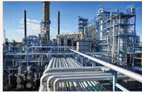
Oil & Gas (OSBL)