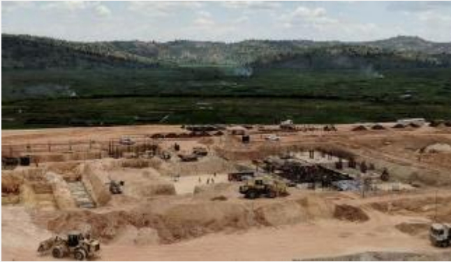
Large Area Grading