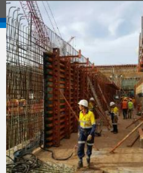
Modern Shuttering Systems