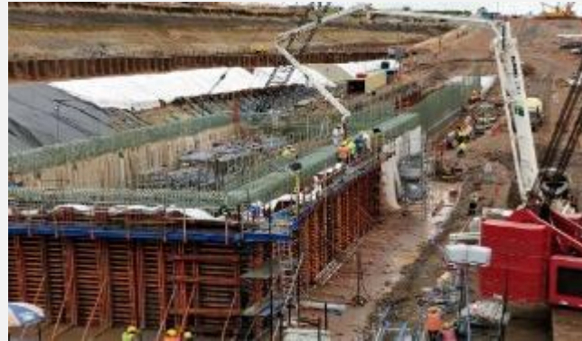
Complex Construction with Well Point Dewatering