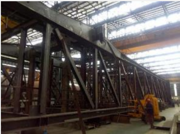
Heavy Structural Fabrication