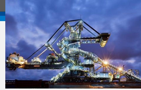
Bulk Material Handling