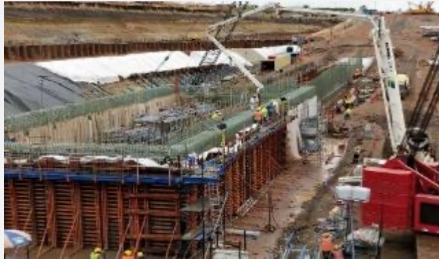
Complex Construction with Well Point Dewatering