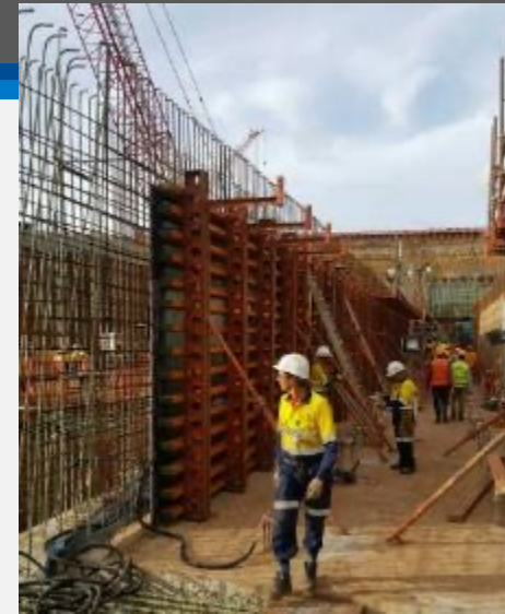
Modern Shuttering Systems