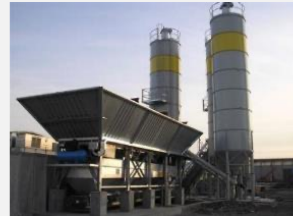
Modern Construction Machinery